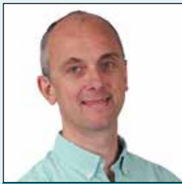
Clinical Lead for Liver Disease

The network has oversight of implementation networks: