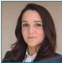
Clinical Lead for Inflammatory Bowel Disease