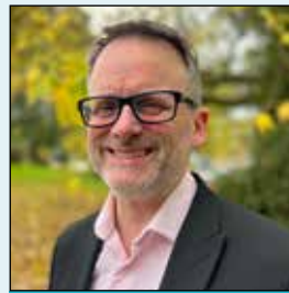
Lead Chief Executive